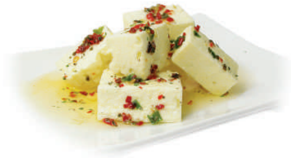
AUSTRALIAN FETA – MARINATED