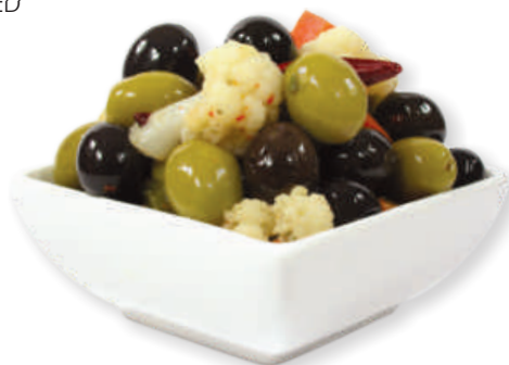
COUNTRY STYLE – GIARDINIERA