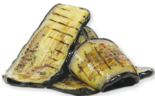
CHARGRILLED &amp; MARINATED EGGPLANT