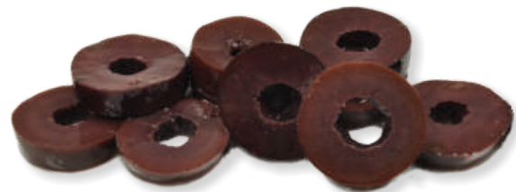
KALAMATA – SLICED