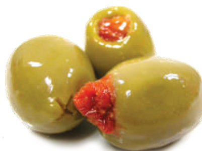
GREEN FILLED SUN-DRIED TOMATO