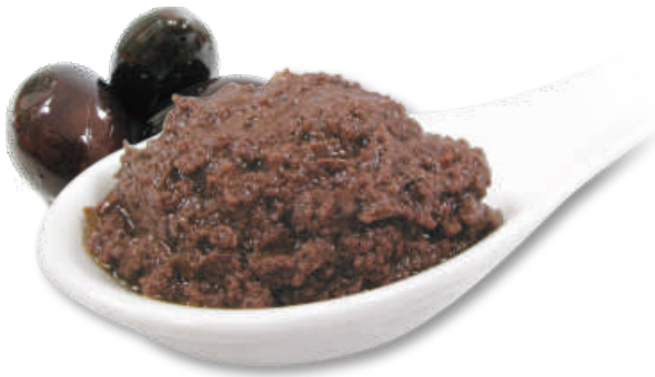
KALAMATA OLIVE SPREAD