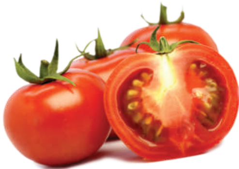
TOMATO – SEMI-DRIED