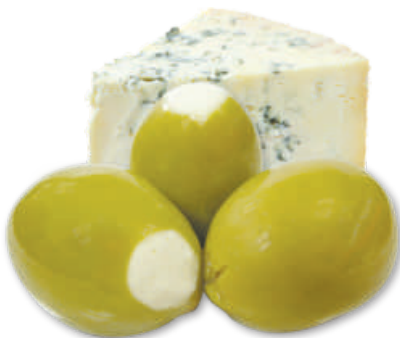
GREEN FILLED BLUE VEIN