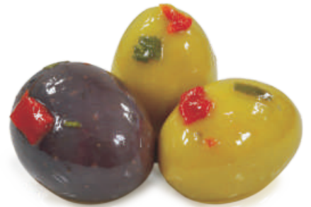
MIXED – MARINATED