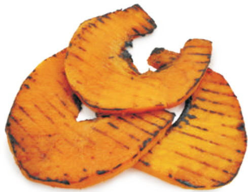
JAP PUMPKIN CHARGRILLED & MARINATED