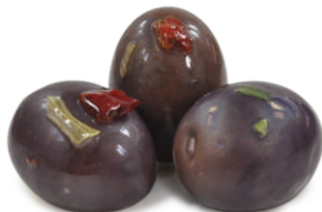
BLACK MAMMOTH – MARINATED