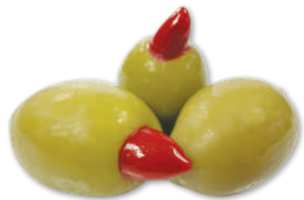
GREEN FILLED CHILLI