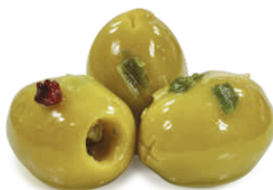
GREEN PITTED – MARINATED