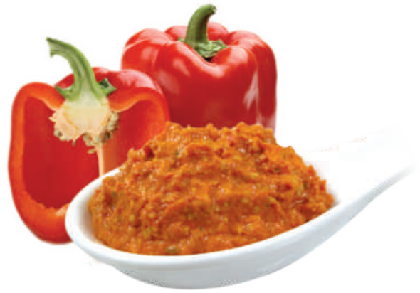
SPICY CAPSICUM PESTO