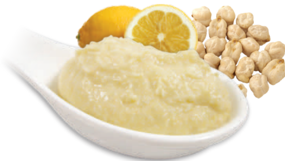
HUMMUS – TRADITIONAL