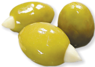
GREEN FILLED ALMOND