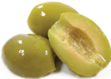
GREEN – HALVES