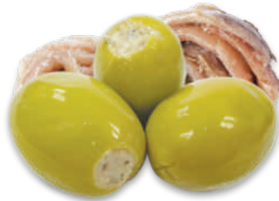
GREEN FILLED ANCHOVY SPREAD