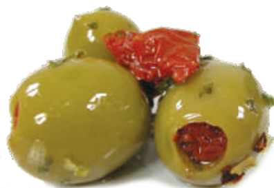
GREEN STUFFED – MARINATED