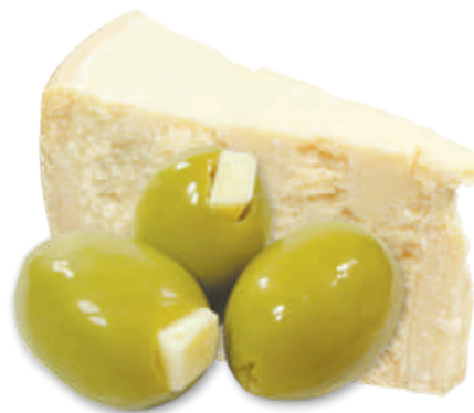
GREEN FILLED PARMESAN