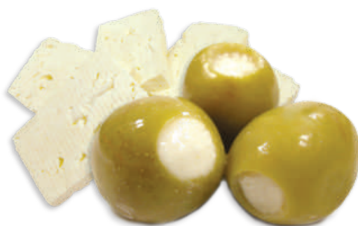
GREEN FILLED FETA