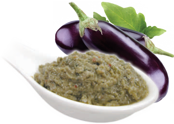
BABA GHANOUSH – CHUNKY