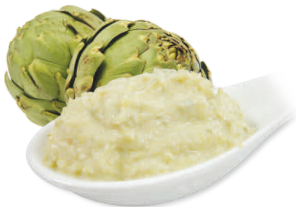
ARTICHOKE - SPREAD