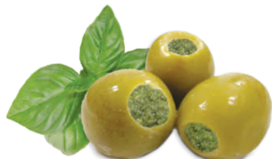
GREEN FILLED BASIL PESTO