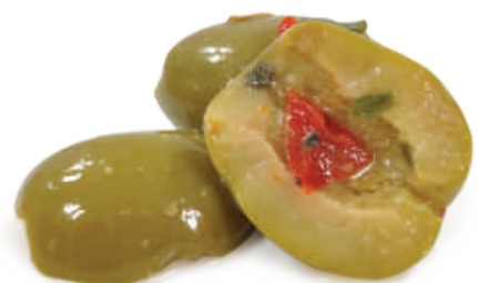
GREEN HALVES – MARINATED