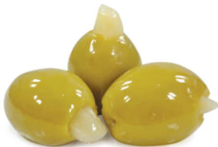
GREEN FILLED GARLIC