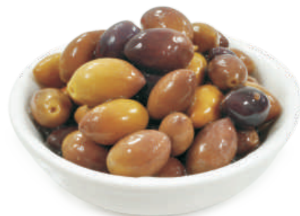
AUSTRALIAN WILD OLIVES