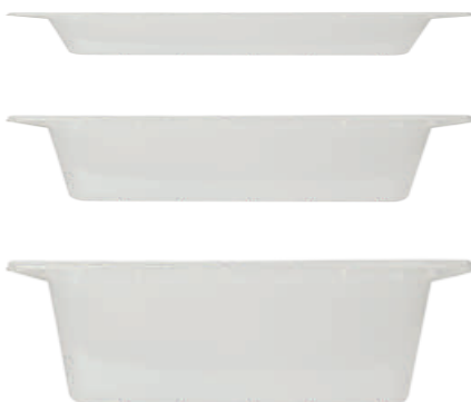
Trays - 5kg, 2.5kg, 1kg