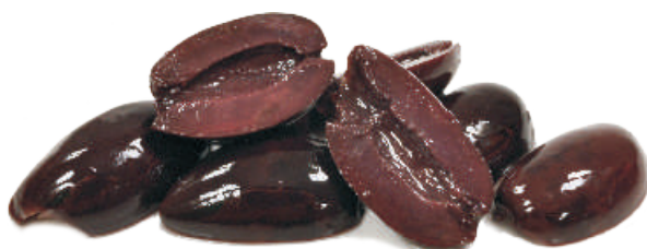
KALAMATA – HALVES