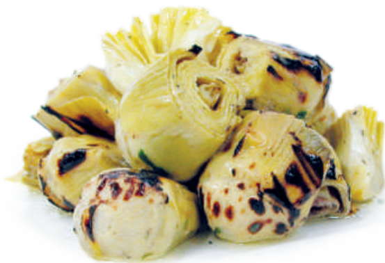
CHARGRILLED & MARINATED ARTICHOKE HEARTS