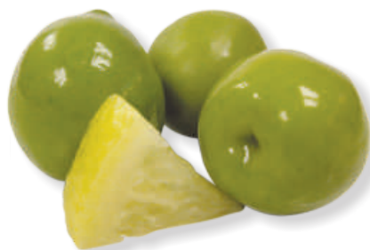
GREEN SICILIAN MARINATED IN LEMON