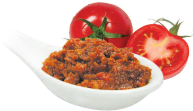
SUN DRIED TOMATO PESTO