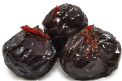
BLACK BAKED – MARINATED