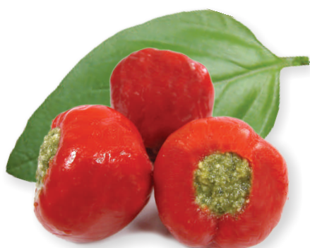
PEPPER BELLE FILLED WITH AUSTRALIAN BASIL PESTO