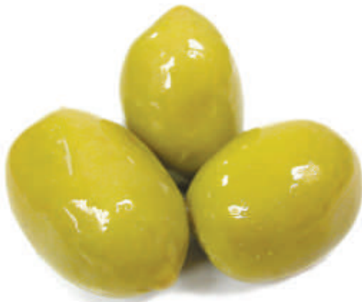
GREEN – WHOLE