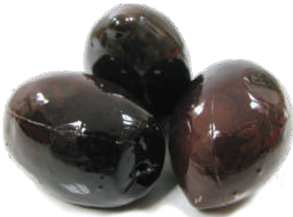
KALAMATA WHOLE IN BALSAMIC