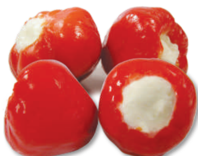
PEPPER BELLE FILLED WITH MASCARPONE