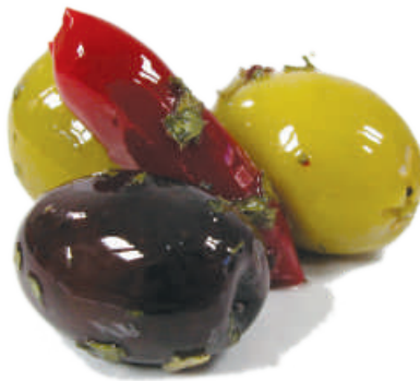
MEDITERRANEAN MIX – PITTED