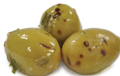
GREEN ROASTED HALKIDIKI