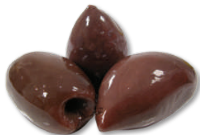
KALAMATA – PITTED