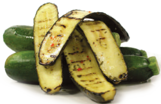
ZUCCHINI CHARGRILLED – MARINATED