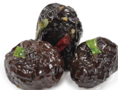
KALAMATA BLACK DRY – MARINATED