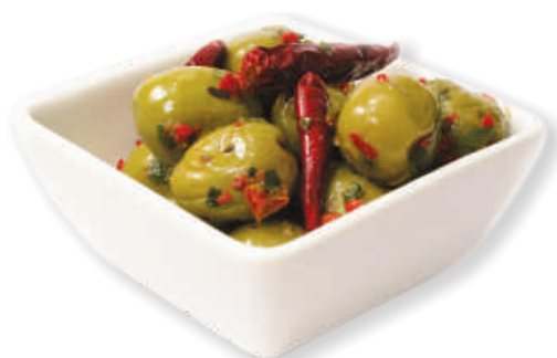
GREEN – MARINATED