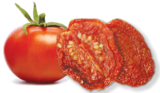
TOMATO – SUN-DRIED HALVES