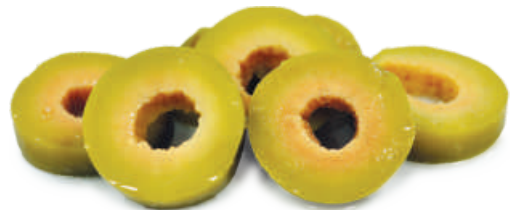
GREEN – SLICED