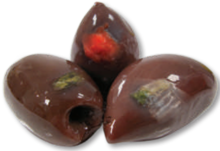
KALAMATA PITTED – MARINATED