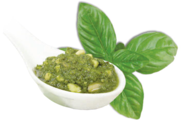
BASIL PESTO – TRADITIONAL