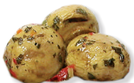
CHARGRILLED &amp; MARINATED MUSHROOMS