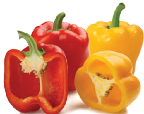
CHARGRILLED & MARINATED CAPSICUM