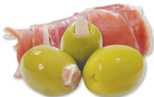
GREEN FILLED PROSCIUTTO