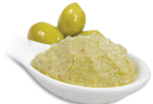
GREEN OLIVE SPREAD