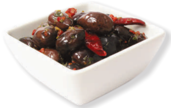
KALAMATA WHOLE – MARINATED