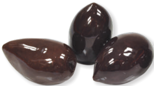
KALAMATA – WHOLE