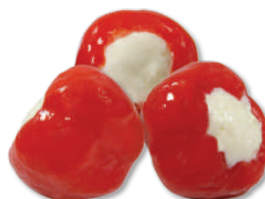
PEPPER BELLE FILLED WITH AUSTRALIAN FETA