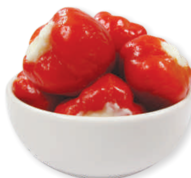
PEPPER BELLE FILLED WITH CREAM CHEESE