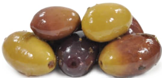
AUSTRALIAN LIGURIAN – MARINATED