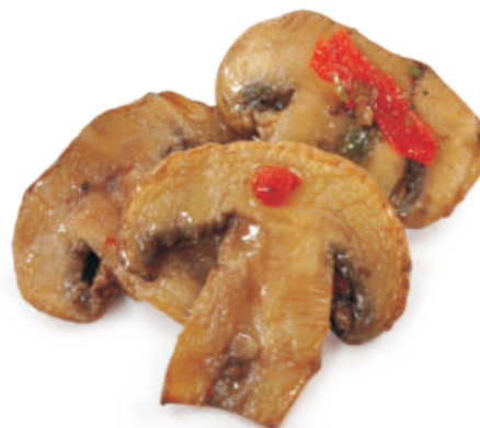
SLICED MARINATED MUSHROOMS