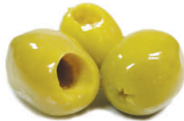
GREEN – PITTED