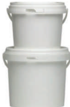
10kg &amp; 15kg buckets