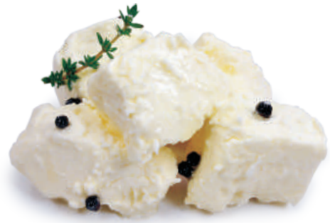
SMOOTH MARINATED FETA