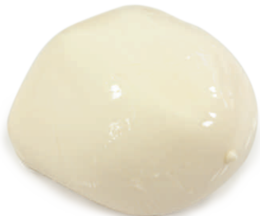
FIOR DI LATE