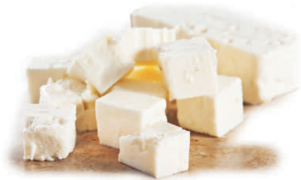
MARINATED GOATS FETA