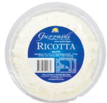
Ricotta - 3kg R/W